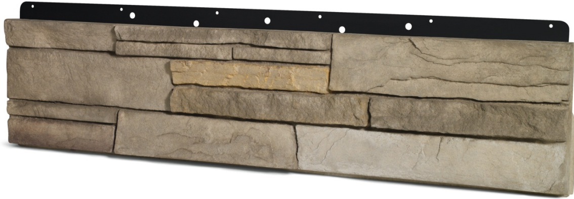
Figure 1: Versetta Stone® Panel with Nailing Hem (across top of panel)