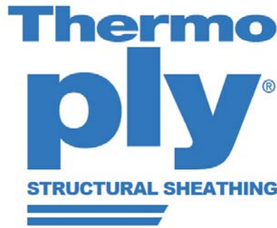
Figure 1: Thermo-Ply® Blue Structural Sheathing