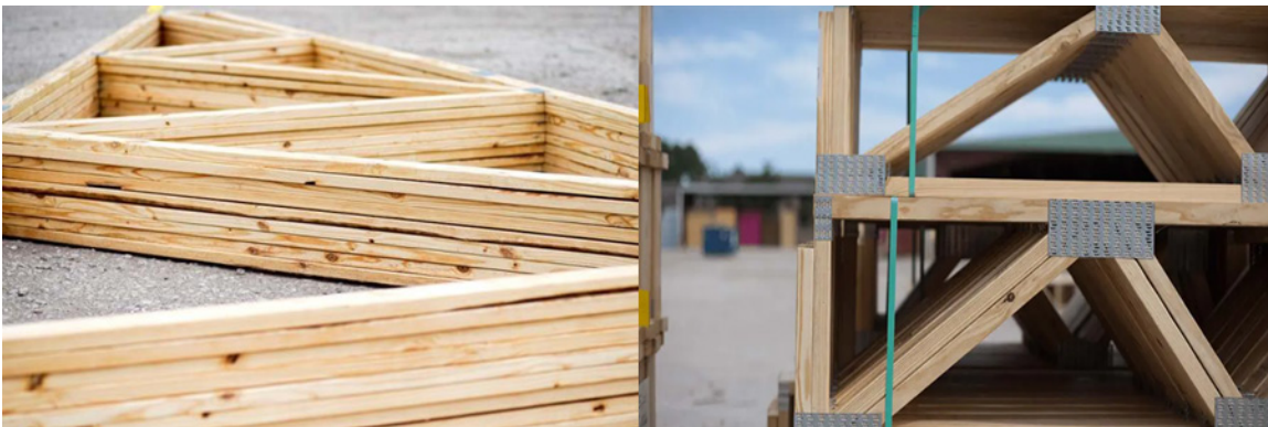
Figure 1. Trussway Roof and Floor Trusses