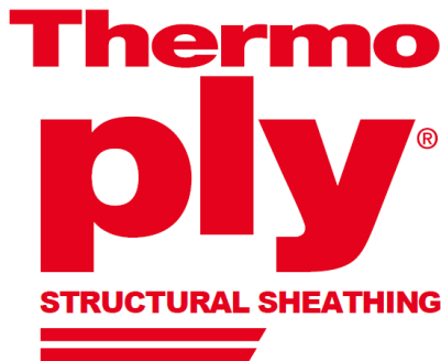
Figure 1. Thermo-Ply® Red Structural Sheathing