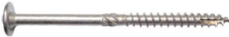
FIGURE 7. SCTX CONSTRUCTION LAG STAINLESS STEEL SCREW