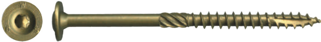
FIGURE 1. CTX CONSTRUCTION LAG SCREW