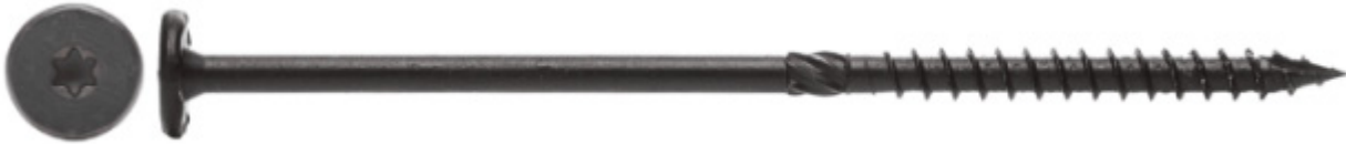
FIGURE 8. WTX WAFER HEAD SCREW