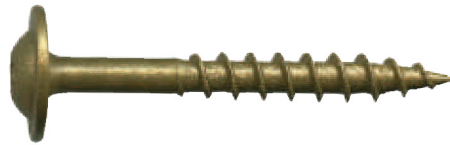
Figure 1. RWH Screw