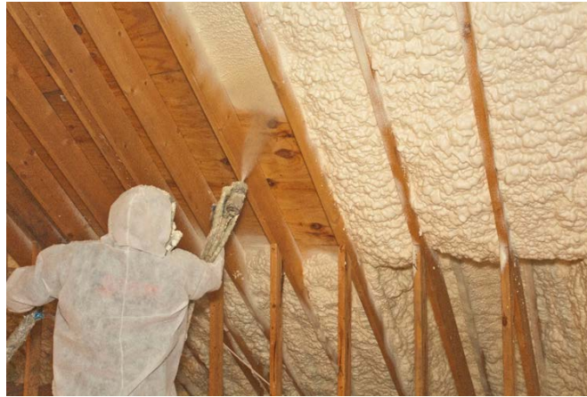
FIGURE 2. APPLICATION OF EASYSEAL.5™ SPRAY FOAM INSULATION IN AN UNVENTED ATTIC