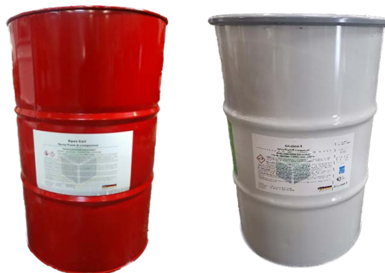
FIGURE 1. EASYSEAL.5™ ISOCYANATE (A-SIDE) AND RESIN (B-SIDE)