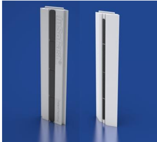
FIGURE 4. INSoFAST® CX LOWPRO SW STUDDED INSERTS