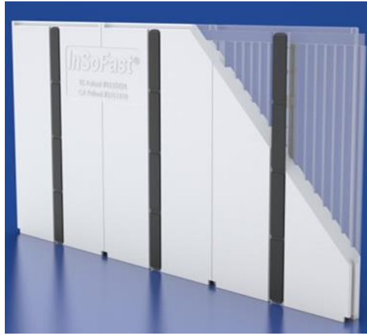
FIGURE 1. INSOFAST® UX 2.0 PANELS