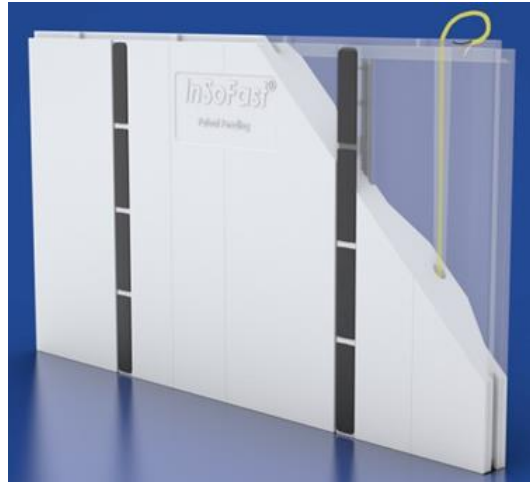
FIGURE 3. INSoFAST® CX44 PANELS