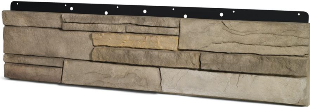
FIGURE 1. VERSETTA STONE® PANEL WITH NAILING HEM (ACROSS TOP OF PANEL)