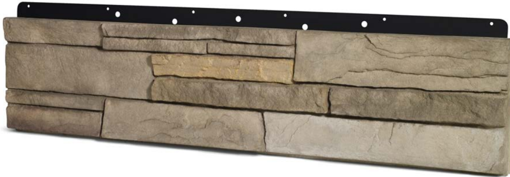
FIGURE 1. VERSETTA STONE® PANEL WITH NAILING HEM (ACROSS TOP OF PANEL)