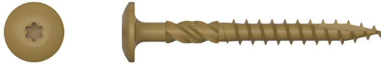
Figure 3. #8 Grip Fast Premium Cabinet Screws