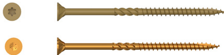
Figure 6. #10 Product 1 - CSH-TP TC Fastener with Exterior Coating (Top) and Interior Coating (Bottom)