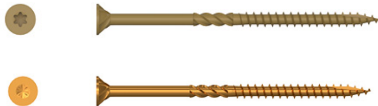
Figure 4. #9 Product 1 - CSH-TP TC Fastener with Exterior Coating (Top) and Interior Coating (Bottom)