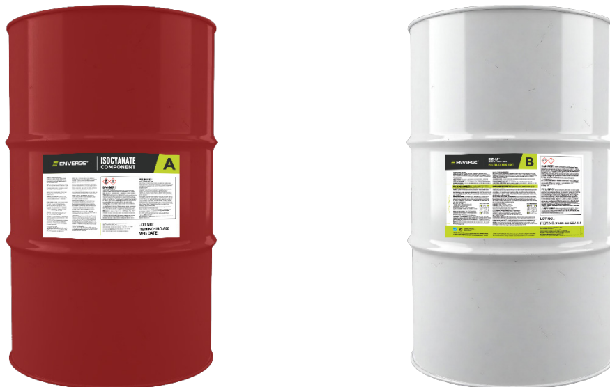
Figure 1. Enverge EasySeal Ultra Spray Foam Insulation Isocyanate (A-Side) and Resin (B-Side)

2.1 The innovative product evaluated in this report is shown in Figure 1 and Figure 2 .