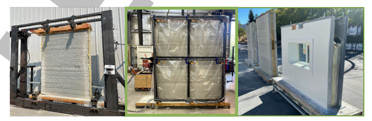
Figure 1. Diamond Age 3D Composite Wall System

2.1 The innovative product evaluated in this report is shown in Figure 1 .