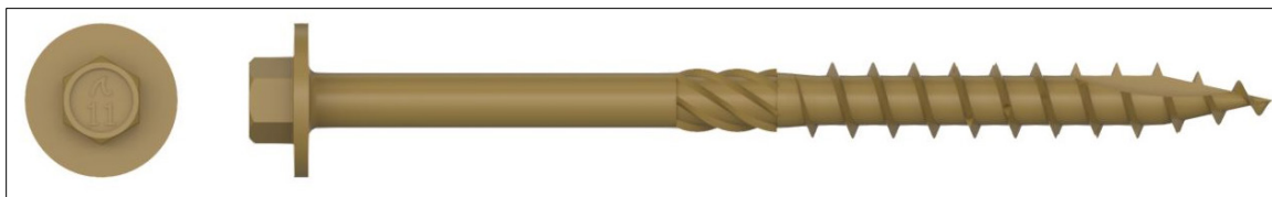
Figure 3. #18 BLG Hex Head Structural Screw