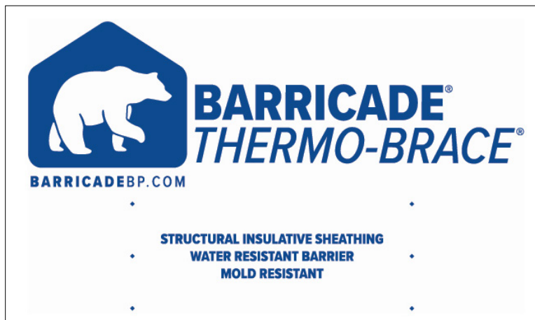
Figure 1. Thermo-Brace Blue Structural Sheathing Label