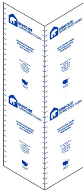
Figure 2. Thermo-Brace Blue Guard (Corner Sheathing)

2.2 Thermo-Brace Blue Structural Sheathing is composed of pressure-laminated plies consisting of high-strength cellulosic fibers. These fibers are specially treated to be water resistant and are bonded with a proprietary water resistive adhesive. A protective polymer layer is applied on both sides of the panel, additionally, foil facings may be applied on one or both faces.