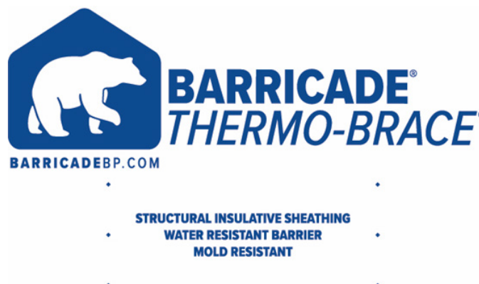
Figure 1. Thermo-Brace Blue Structural Sheathing Label

2.1 The innovative products evaluated in this report are shown in Figure 1 and Figure 2 .