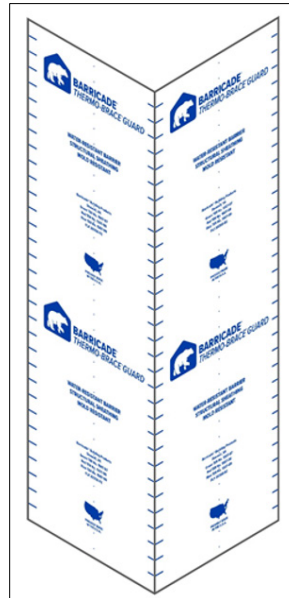
Figure 2. Thermo-Brace Blue Guard (Corner Sheathing)

2.2 Thermo-Brace Blue Structural Sheathing is composed of pressure-laminated plies consisting of high-strength cellulosic fibers. These fibers are specially treated to be water resistant and are bonded with a proprietary water resistive adhesive. A protective polymer layer is applied on both sides of the panel. Additionally, foil facings may be applied on one or both faces.