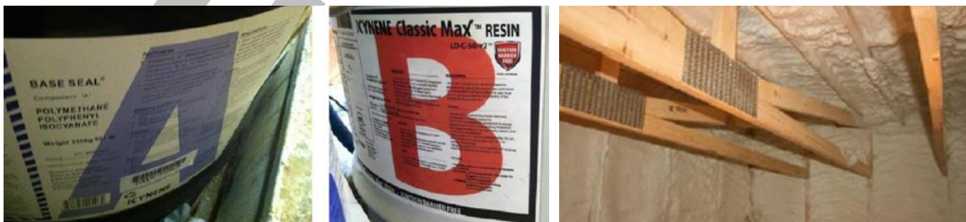
FIGURE 1. ICYNENE CLASSIC PLUS SPF IN UNVENTILATED ATTICS