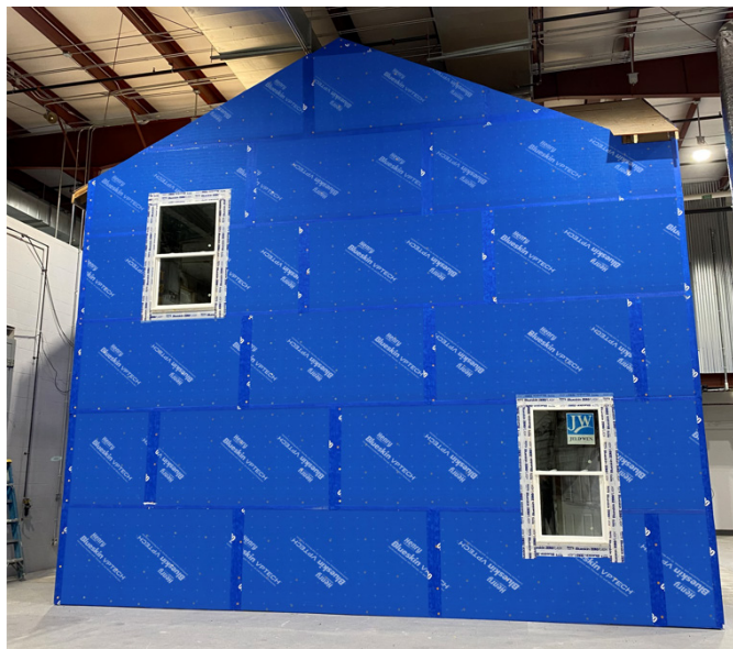
Figure 1. 1" Blueskin VP Tech

2.1 The innovative product evaluated in this report is shown in Figure 1 and Table 1 .