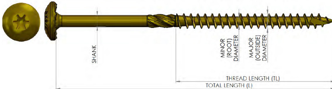
Figure 3. CS Construction Screw