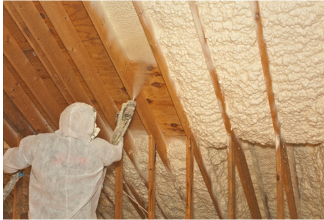
Figure 2. Application of EasySeal .5 Spray Foam Insulation in an Unvented Attic