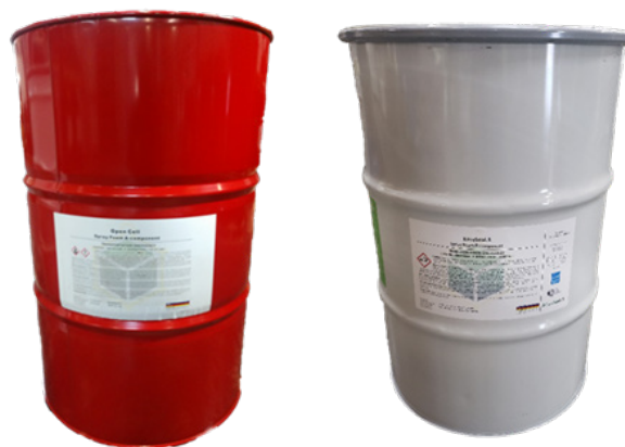
Figure 1. EasySeal .5 Isocyanate (A-Side) and Resin (B-Side)

2.1 The innovative product evaluated in this report is shown in Figure 1 and Figure 2 .