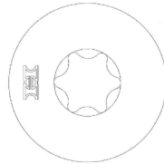
Figure 3. ConnexTite™ Countersink Head Detail