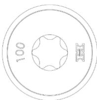
Figure 1. ConnexTite™ Flange Head Detail