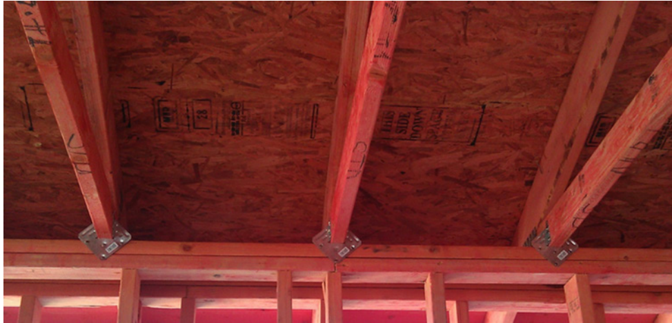
Figure 1. TechWood 4400 (TW4400) Product