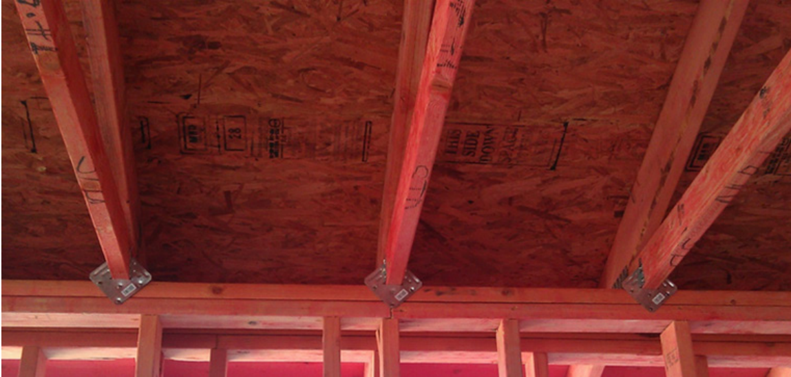
Figure 1. TechWood 4400 (TW4400) Product

2.1 The innovative product evaluated in this report is shown in Figure 1 and Figure 2 .